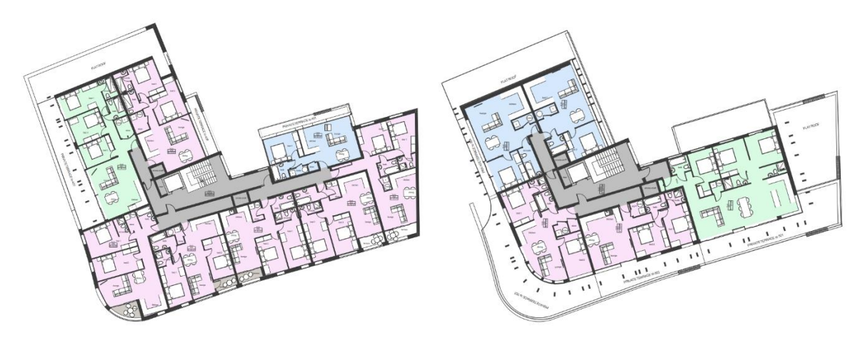
Fifth floor plan: