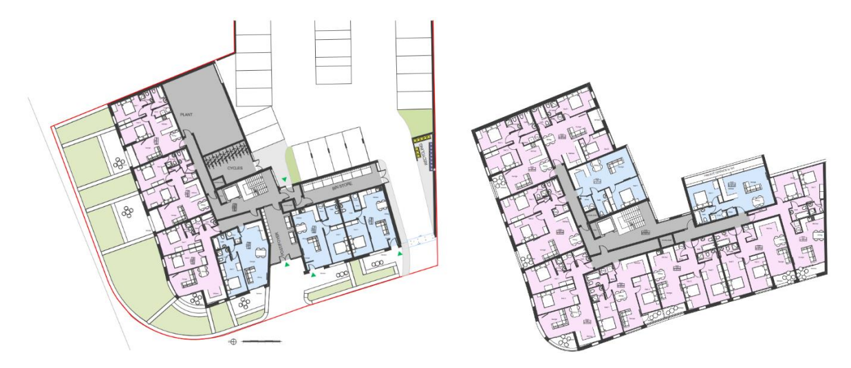
Fourth floor plan: