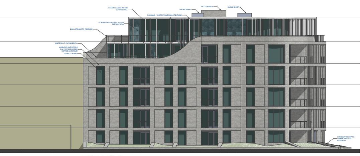
North Bld. - North Elevation